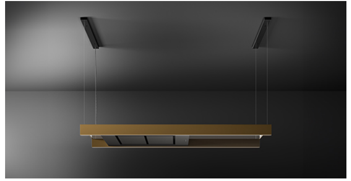
The photograph is purely for information It may not correspond to the selected version.